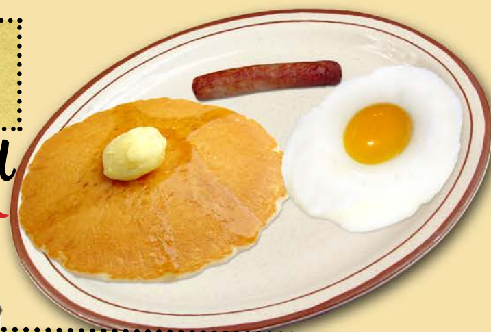
1 Egg, 1 Pancake, Bacon or Sausage

Served Monday - Friday 6:00 a.m. - 10:00 a.m.