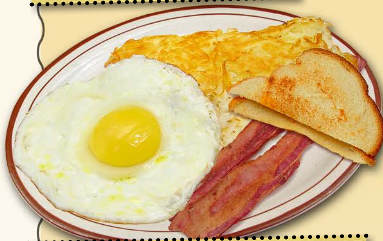
1 Egg, 2 Bacon or Sausage and Hash Browns

Hamburger Gravy over Toast or Biscuits with one Eggs $8.25