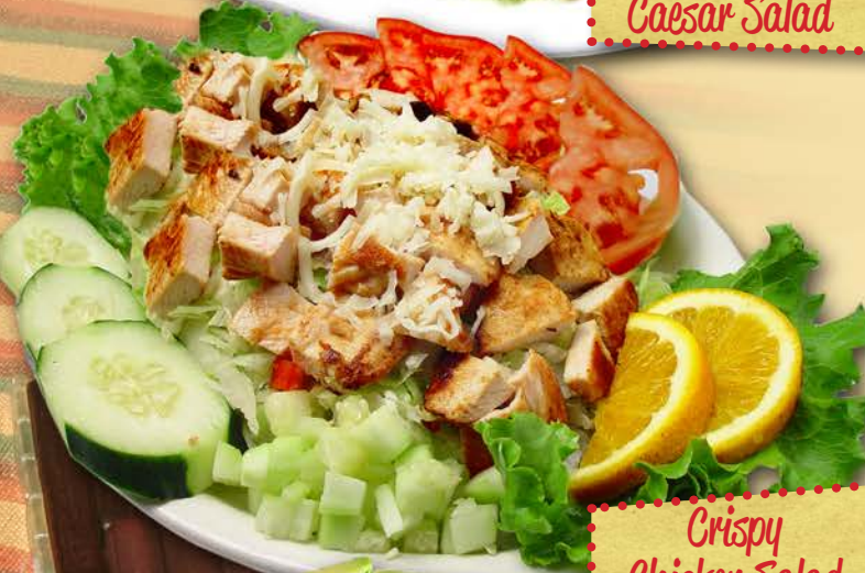
Crispy Chicken Salad

Made with Romaine Lettuce, Caesar Dressing, our home-made Croutons and Parmesan Cheese. Choose Chicken, Prawns or Salmon. .... $12.25