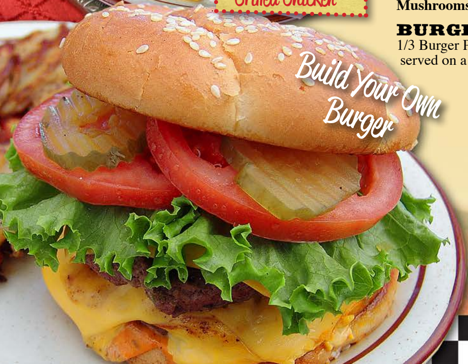
Build Your Own Burger