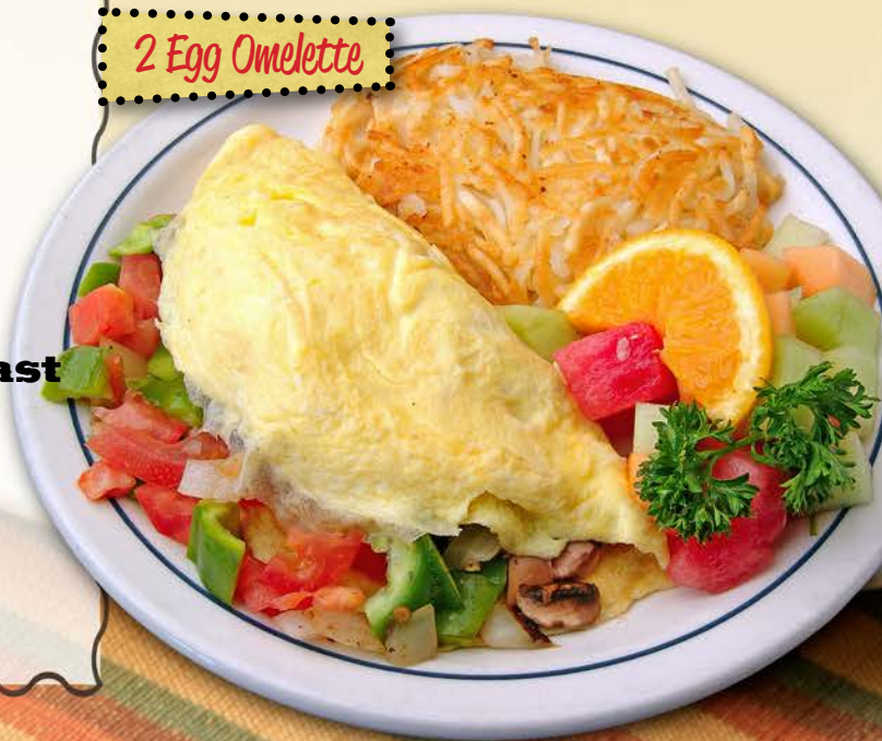
2 Egg Omelette

No substitutions on the Value Menu. Not discountable. Not available with any coupon. Not available on holidays.