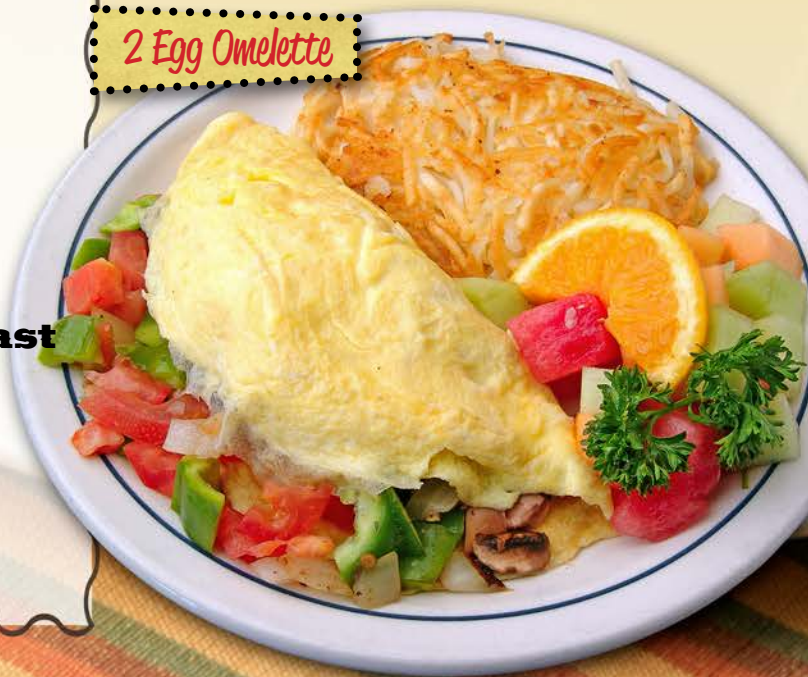
2 Egg Omelette

No substitutions on the Value Menu. Not discountable. Not available with any coupon. Not available on holidays.